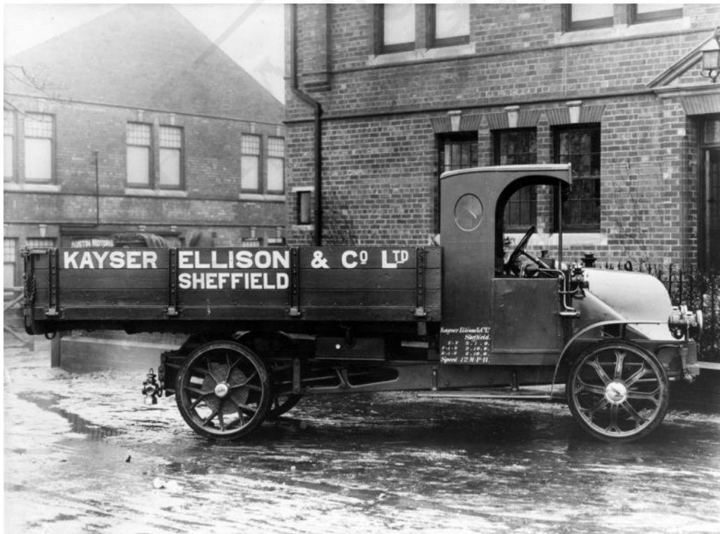
Austin. 1918. 2-3 ton Lorry. For Kayser Ellison, Sheffield.

A new 2-3 ton lorry outside the Austin works ready for delivery to Kayser Ellison, Sheffield.